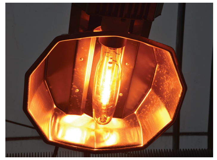
Figure 3. Reflector and bulbs with dust, finger prints and water spots

timing can be reduced by up to 50% depending on the species when the DLI is maintained between 10 to 12 mol·m<sup>-2</sup>·d<sup>-1</sup> for ornamentals and 12 to 15 mol·m<sup>-2</sup>·d<sup>-1</sup> for vegetables.