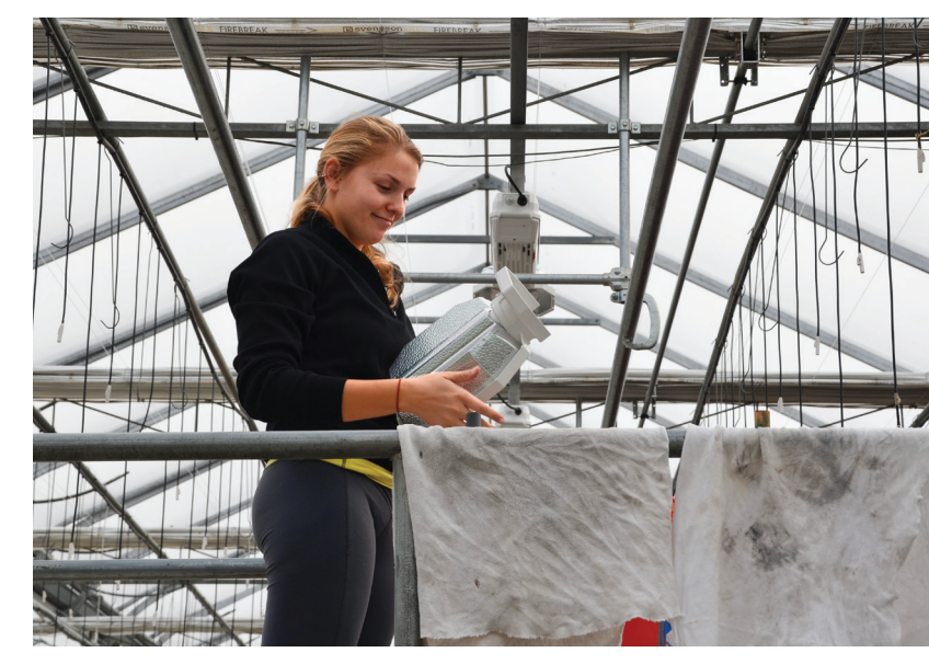
Figures 4a & 4b. A high-pressure sodium reflector has been removed from the fixture and is ready to be cleaned.

P.L. Light Systems says that if the HPS installation is in a clean environment, or if the reflectors are 1 to 3 years of age, it is possible to clean them with a solution of vinegar and water mixed at a ratio of 1:100. They also advise cleaning your bulbs and reflectors annually for best performance. ( Please note that not all manufactures recommend cleaning reflectors. Therefore, you should contact the manufacture of your HPS fixtures for their specific recommendations. Most manufacture can test your reflectors and tell you if