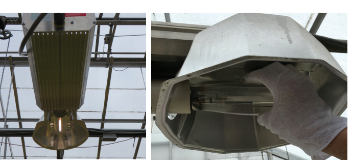
Figures 2a & 2b. Flickering or dim HPS bulbs should be replaced. When installing new bulbs, always use a white glove to prevent leaving fingerprints on the bulb.